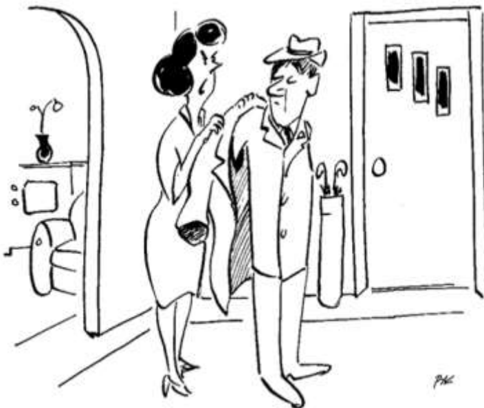
"I hate that smug look you get when you're going to a closed meeting!"